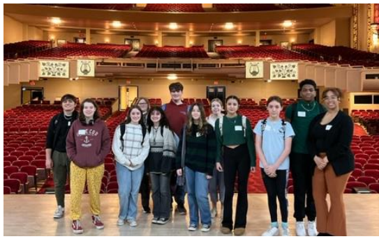
Bushnell Field Trip Careers Associated with the Theater